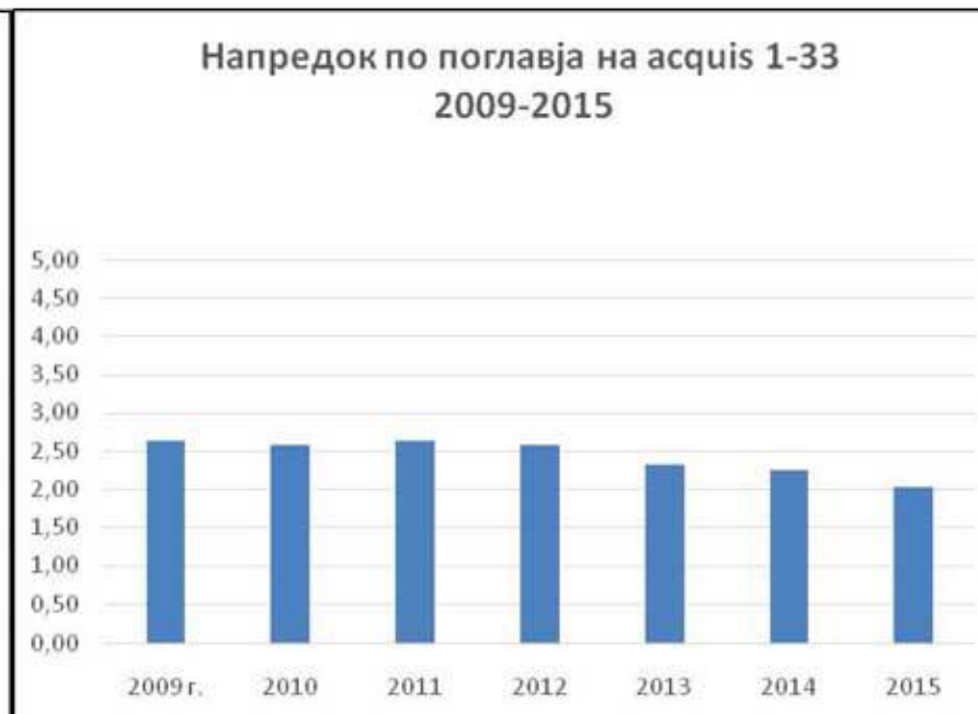
Level of alignment with the acquis/alignment by chapters